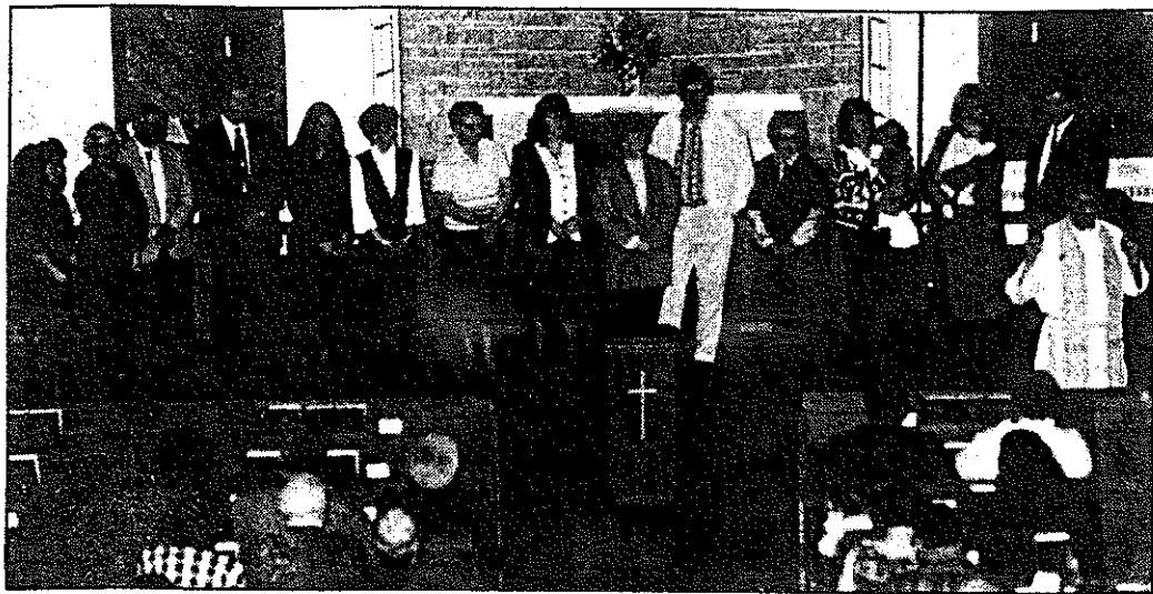
New members assimilated at Immanuel, Twin Falls, Idaho.