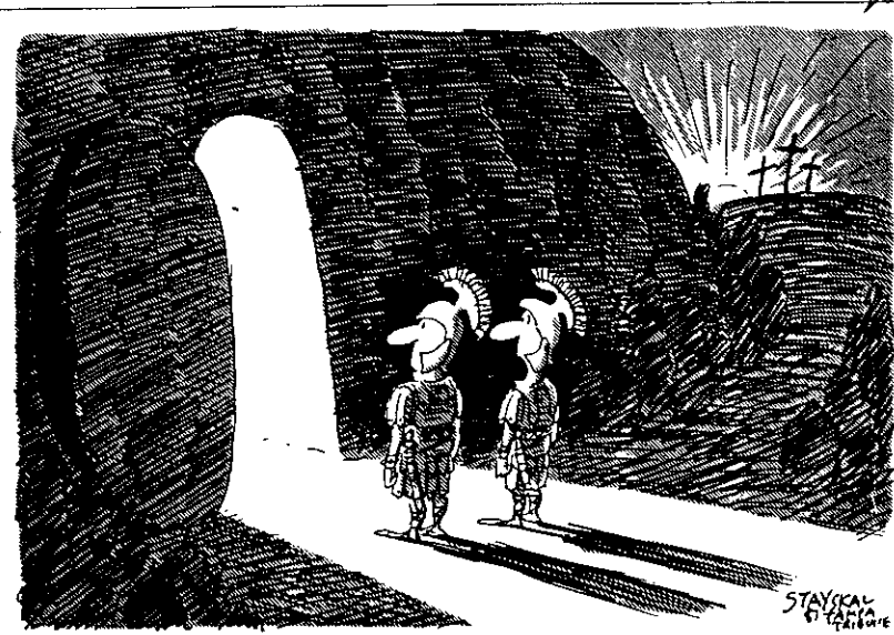
"Well, I can't explain this either... but I'm sure in a few days everybody will forget all about it!"