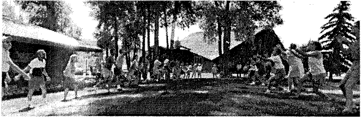
Want to play catch? Let's use an egg!